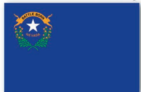
Nevada State Flag