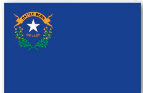
Nevada State Flag